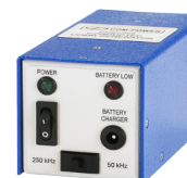
CGC-255E Conducted Comb Generator