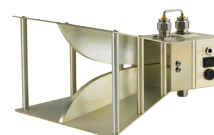
AHA-118 Active Horn Antenna (1-18 GHz)