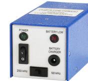
CGC-255E Conducted Comb Generator