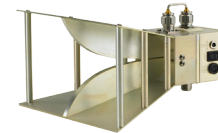
AHA-118 Active Horn Antenna (1-18 GHz)